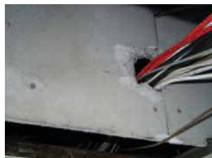
Asbestos insulating board panels