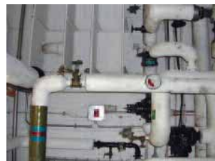
Asbestos insulation on pipes