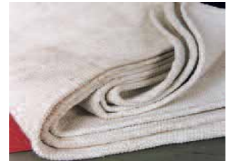
Asbestos fire blanket

Don't work on these materials - you need a licence to do so