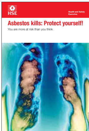
This is a web-friendly version of leaflet INDG419

Are you an electrician, plumber, heating and ventilation engineer, joiner or do you work in a similar building or maintenance trade?