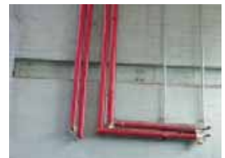
Asbestos lagging on pipes