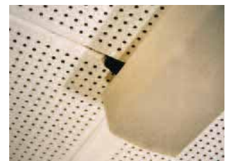
Asbestos insulating board ceiling tiles