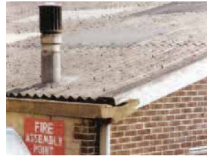
Asbestos cement roof