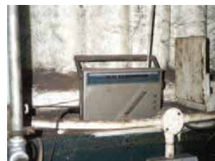
Sprayed coatings on wall