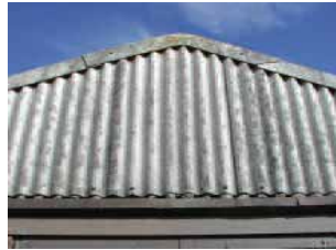
Asbestos cement wall panel

Only work on these (non-licensed materials) if you've had the proper training and have the right protective equipment and controls in place