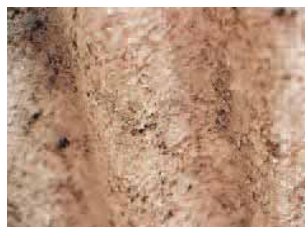
Sprayed coatings on ceiling walls, beams/columns

Don't work on these materials - you need a licence to do so